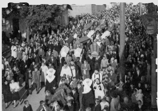
■ Burial of the victims of the train raid near Zatyłe

Genocide is a legal category. The Volhynian massacres have all the traits of genocide listed in the 1948 UN Convention on the Prevention and Punishment of the Crime of Genocide, which defines genocide as an act “committed with intent to destroy, in whole or in part, a national, ethnical, racial or religious group, as such.” In Polish academia the Volhynian massacres are referred to as genocidal ethnic cleansings, the Volhynian (or Volhynian-Galician) slaughter, or, in legal terminology, the crime of genocide. Regardless of which qualification of the Volhynian massacres is the most suitable, there is