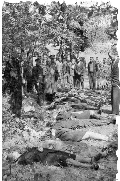
■ Victims of the train raid near Zatyle (near Lubycza Królewska) executed on 16 June 1944 by UPA.

Poles had to abandon their homes and seek shelter in the cities and towns which had posts of Hungarian and German troops. It was an irony that in order to escape from the UPA Poles had to seek protection from their oppressors: firstly from the Germans, and during 1944–1945 from the Soviets. The Germans deported Polish escapees to the Reich to forced labor. To escape the massacres some escapees tried to get to the General Government, particularly to the Lublin District. Finally, a small number of Poles created self-defence centers to protect themselves, with the most well-known ones located in Przebraże (where 10,000 Poles defended themselves), Huta Stepańska (600 Poles dead), Zasmyki, Dederkały, and Ostróg. Due to the lack of arms, ammunition, and a cadre of commanders most of the approx. 100 Polish self-defence centers were defeated.