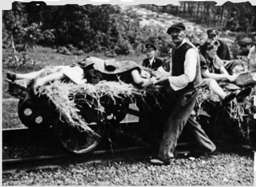
■ Victims of the train raid near Zatyłe (near Lubyca Królewska) executed on 16 June 1944 by UPA.